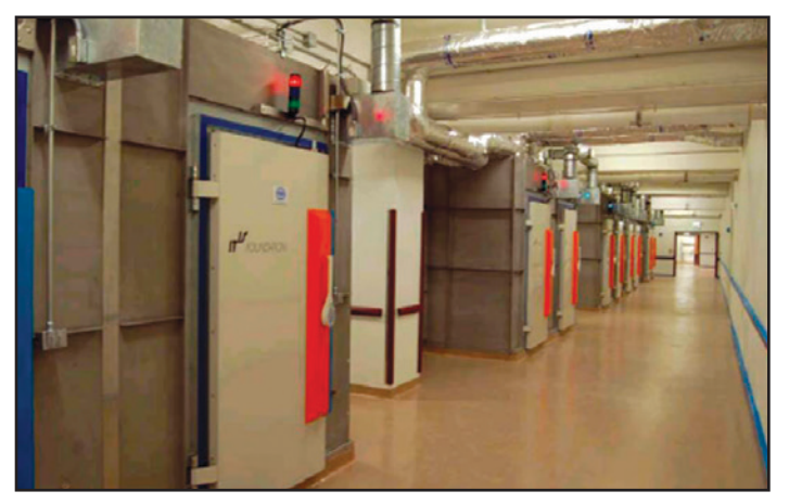
Chambers at the IIT Research Institute in Chicago where the studies took place

NTP and RFR experts from the National Institute of Standards and Technology (NIST) and the IT'IS Foundation designed and built the chambers specifically for these studies.