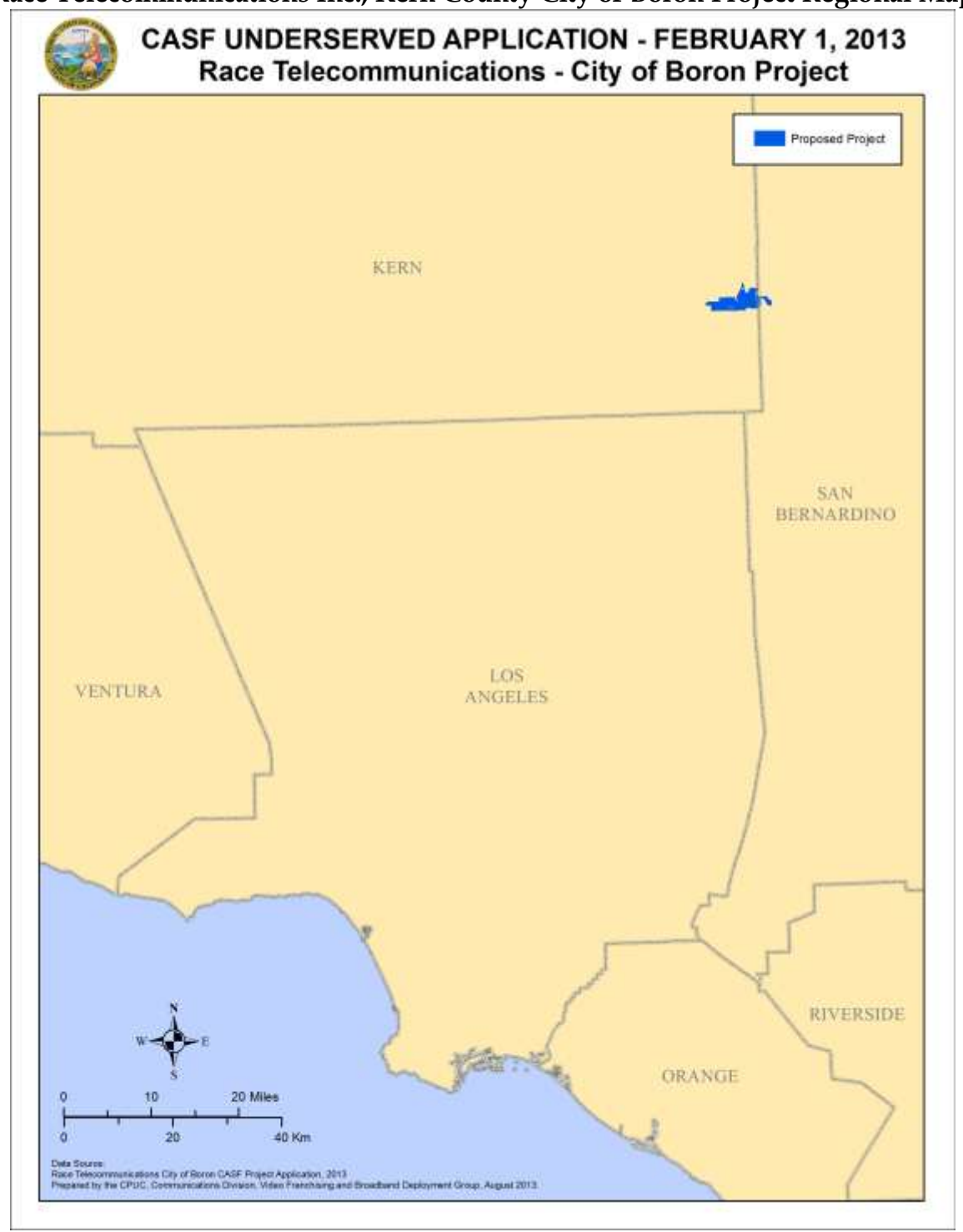
APPENDIX A Resolution T-17416 Race Telecommunications Inc., Kern County City of Boron Project Regional Map