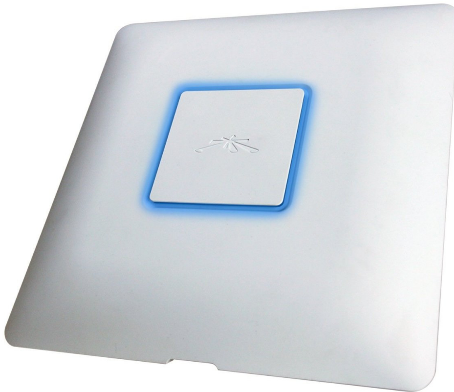
Figure 3 Ubiquiti Networks UniFi AC Enterprise WiFi System- UAP-AC