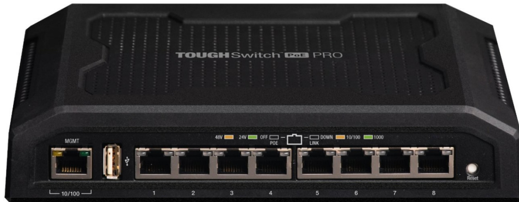
Figure 6 Ubiquiti 8 Port TOUGH SWITCH POE PRO

Projects will also require either hardware or software to manage the network, as well as a router to provide a firewall and routing connection to the bandwidth source. Such equipment may include the items illustrated in Figures 7-8.