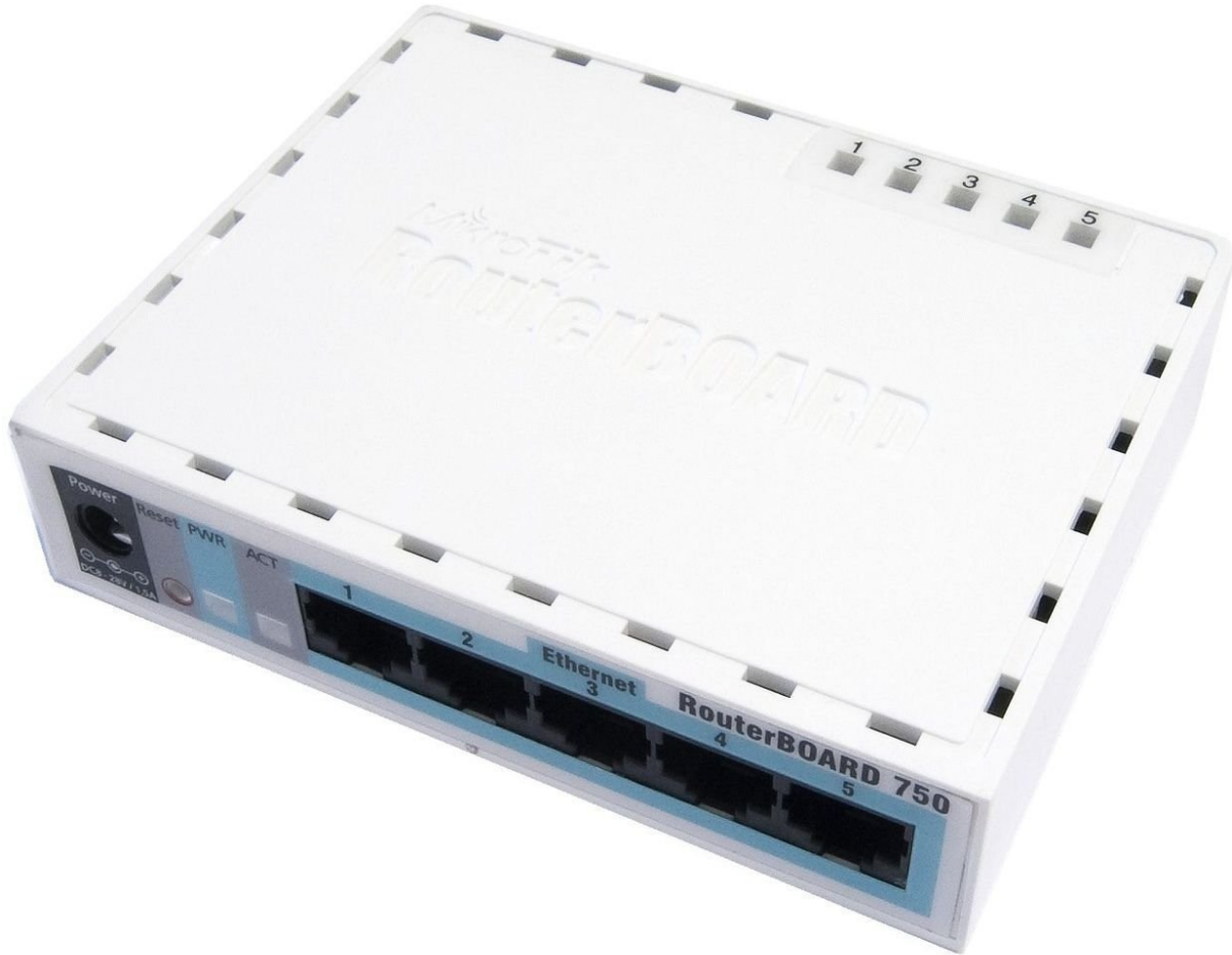
Figure 8 Microtik RB/750UP Mini-Router

Ken Biba of Novarum provided the following three estimates. Novarum provides strategic consulting and analysis for the wireless broadband data industry, focusing on the key technologies of Wi-Fi, WiMAX and 3G cellular data.