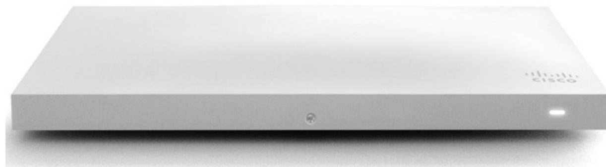
Figure 4 Cisco Meraki MR34 Indoor Cloud Managed Access Point

Projects will also require a concentrator/switch, such as those illustrated in Figures 5-6. Enterprise class access points are powered through the Ethernet cable that connects the access points to the concentrator/switch with powers the access points and aggregates them for connection at a single Internet connection.