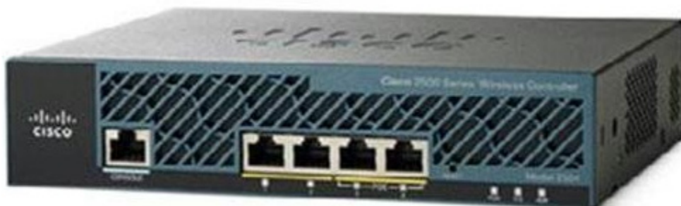
Figure 7 Cisco Air 2504 Wireless Local Area Network (LAN) Controller

Projects will also require either hardware or software to manage the network, as well as a router to provide a firewall and routing connection to the bandwidth source. Such equipment may include the items illustrated in Figures 7-8.