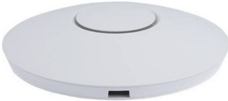
Figure 1 Ubiquiti Networks UniFi UAP-Pro Enterprise Wi-Fi System