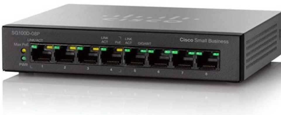
Figure 5 Cisco Systems 8-Port Gigabit (SG100D-08P-NA)

Projects will also require a concentrator/switch, such as those illustrated in Figures 5-6. Enterprise class access points are powered through the Ethernet cable that connects the access points to the concentrator/switch with powers the access points and aggregates them for connection at a single Internet connection.