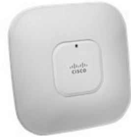
Figure 2 Cisco Aironet 1140 Series Access Point