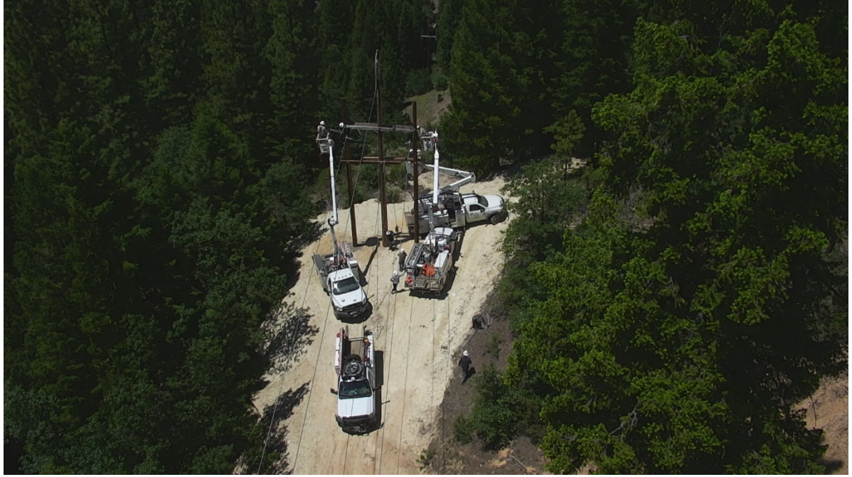
This image illustrates the dense forest and rough terrain of the Long Valley – Spring Garden area.

Fixed Broadband Served Status by Census Block within project area: