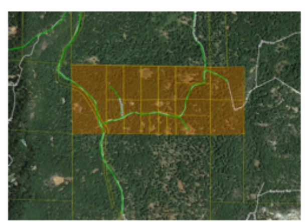
Buckeye Rd Community Nevada City, CA 95959