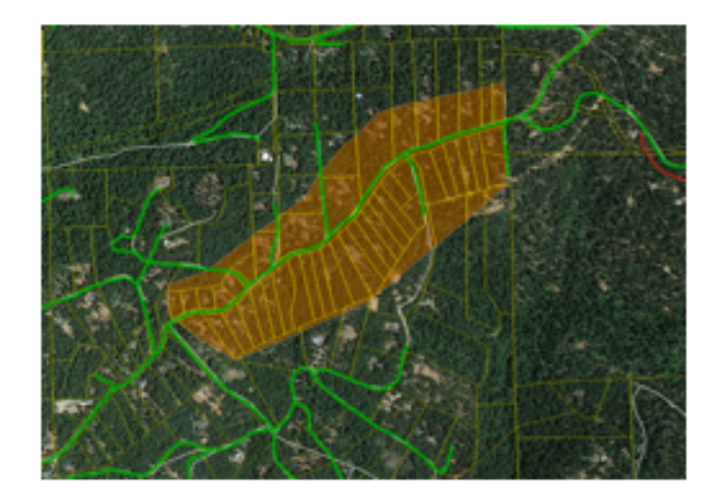
Banner Mountain South Community Nevada City, CA 95959