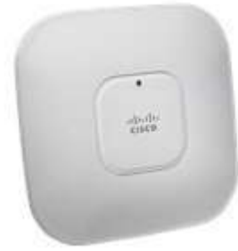
Figure 2 Cisco Aironet 1140 Series Access Point