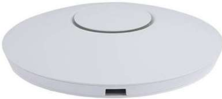
Figure 1 Ubiquiti Networks UniFi UAP-Pro Enterprise Wi-Fi System