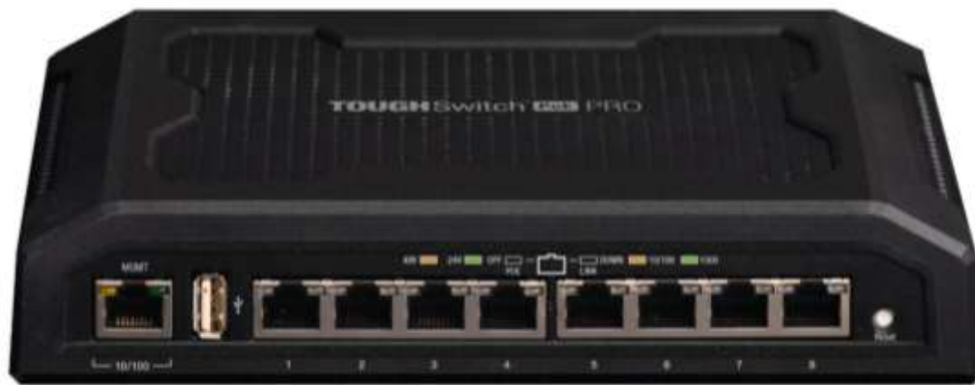
Figure 6 Ubiquiti 8 Port TOUGH SWITCH POE PRO

Projects will also require either hardware or software to manage the network, as well as a router to provide a firewall and routing connection to the bandwidth source. Such equipment may include the items illustrated in Figures 7-8.