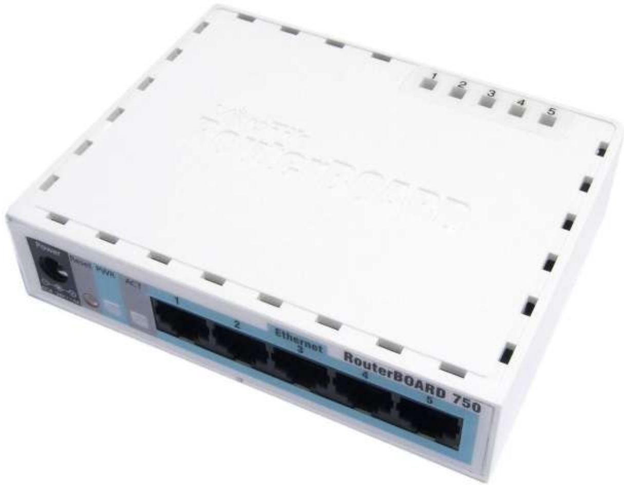
Figure 8 Microtik RB/750UP Mini-Router

Ken Biba of Novarum provided the following three estimates. Novarum provides strategic consulting and analysis for the wireless broadband data industry, focusing on the key technologies of Wi-Fi, WiMAX and 3G cellular data.