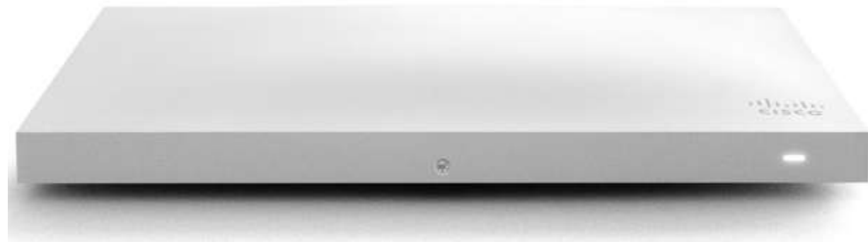
Figure 4 Cisco Meraki MR34 Indoor Cloud Managed Access Point

Projects will also require a concentrator/switch, such as those illustrated in Figures 5-6. Enterprise class access points are powered through the Ethernet cable that connects the access points to the concentrator/switch with powers the access points and aggregates them for connection at a single Internet connection.