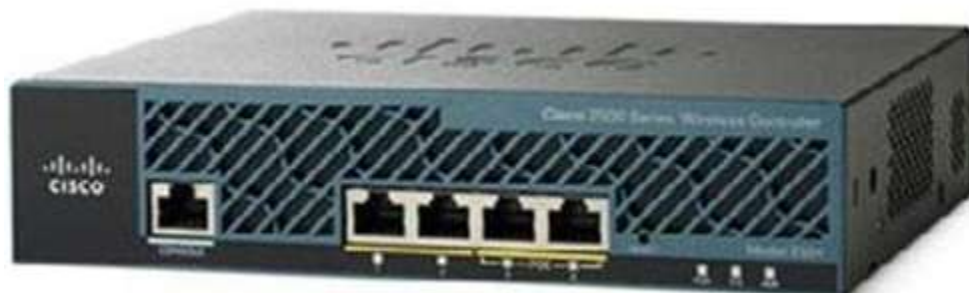
Figure 7 Cisco Air 2504 Wireless Local Area Network (LAN) Controller

Projects will also require either hardware or software to manage the network, as well as a router to provide a firewall and routing connection to the bandwidth source. Such equipment may include the items illustrated in Figures 7-8.