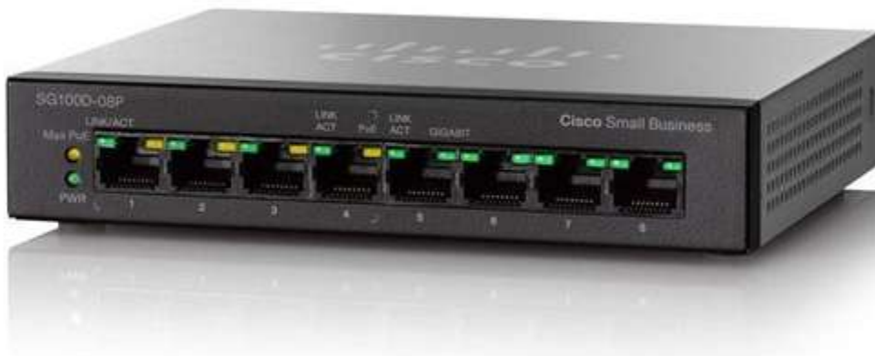
Figure 5 Cisco Systems 8-Port Gigabit (SG100D-08P-NA)

Projects will also require a concentrator/switch, such as those illustrated in Figures 5-6. Enterprise class access points are powered through the Ethernet cable that connects the access points to the concentrator/switch with powers the access points and aggregates them for connection at a single Internet connection.