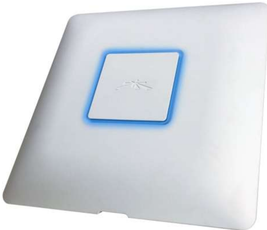
Figure 3 Ubiquiti Networks UniFi AC Enterprise WiFi System- UAP-AC